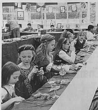
All Saints Catholic School's fifth-graders took a trip back to the 1500s as they studied the Renaissance period.